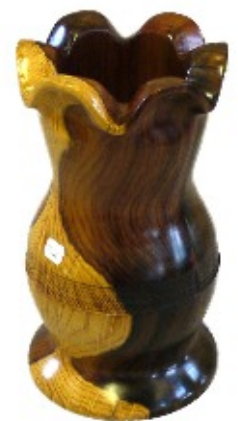
Mike Pollard's vase with textured embellishment