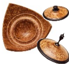
Peter Castle's box showing inner and outer lids.