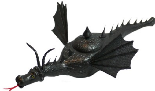
A dragon box by Sandra Day tied second in the Founder's cup.