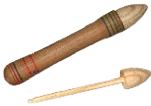
Gareth's idiot stick also showing inner piece separately

After lunch members set to work at the lathes to have a go at turning bottle stoppers supervised by more experienced members. The stoppers were more straight forward to turn and the club provided plastic inserts to fit to them.