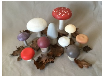
4A, Lifesize British fungi in painted maple.