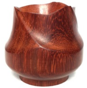
5A, Bubinga pot 3"x3"

NB This will be the last online competition so please bring monthly entries for July to the meeting.