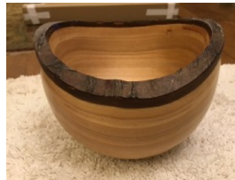
3N Cherry natural edge bowl, 7" x 7"