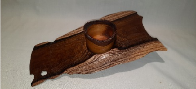
1N, Laburnum and cherry artistic piece. Overall 10"x5", pot 3"high x 2".