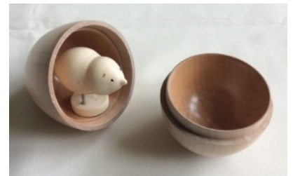
2N, Maple egg with holly chick, 11x7cm.