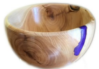
Work by Jayne Brown using some of the accessories for sale (see last page)