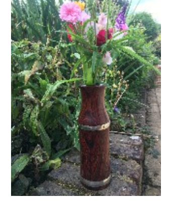
61, Vsse embellished with pewter inlaid with brass and resin.