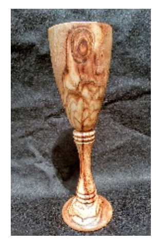
8A, Flute in olive wood, 7" high.