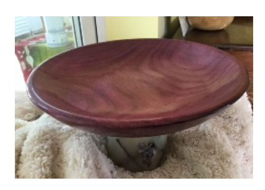
2N, Bowl in purpleheart, 10" diameter.