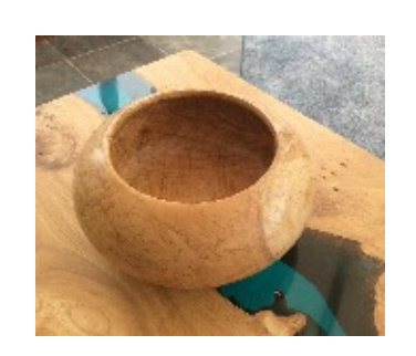
4N, Bowl turned from burr Ash 235mmx105mm.