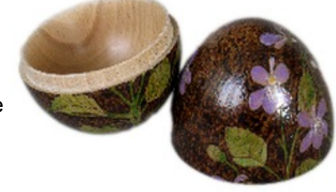
Easter egg with lightly textured chocolate effect, using a ball tip.

Random texturing can be achieved with various standard off the shelf tips such as the ball ones and skews, available in a range of sizes. Specialist tips including shapes for making beads on wood and, popular with carvers, raised scale designs such as on fish, are available from companies such as Razertip, who even offer a custom tip service.