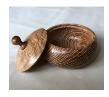
1N, Bowl, probably elm, 5" diameter with mahogany knob.