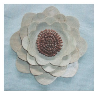
4. Flower in sycamore and pink ivory 5"x1"