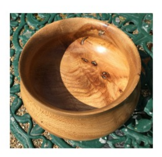
7 Bowl in yew