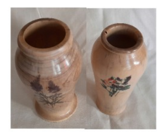
2. Pair of vases in magnolia wood with transfer designs