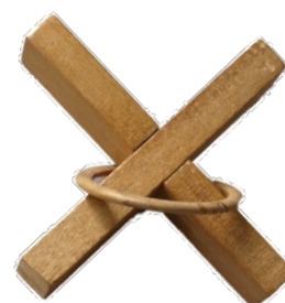
How do you remove the ring without breaking anything?