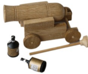
Cannon