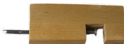
How was the nail fixed? (No joins in the wood)