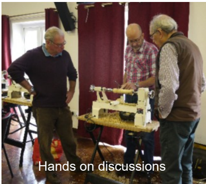
Hands on discussions