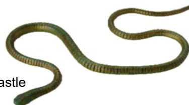
Sinuos snake by Peter Castle