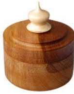
Right, Box by Gary Woodhouse