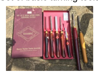
Contact Peter Castle