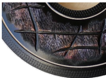
Above, Platter detail. Below, Spinning tops.