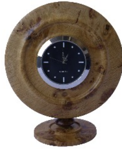
Clock in burrwood by Lynn Chambers