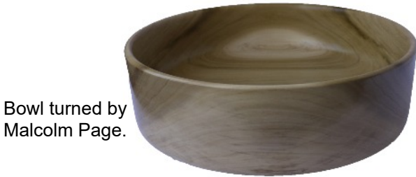
Bowl turned by Malcolm Page.