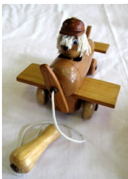
Bobbing pilot