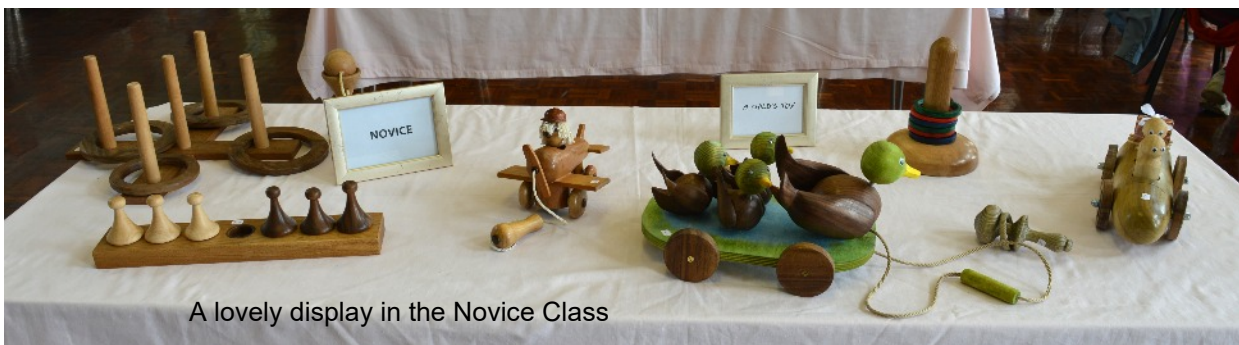
A lovely display in the Novice Class

The advanced class and the Founder's Cup class included the usual high standard of work we have come to expect, ranging from the beautifully delicate and intricate pieces to the complex and large. The club is fortunate to have such a range of skills amongst its members.