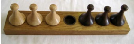
Gregg Collett's entry, made from oak, maple and black walnut.