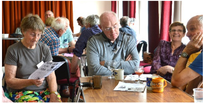
Members busy working out the answers to the quiz