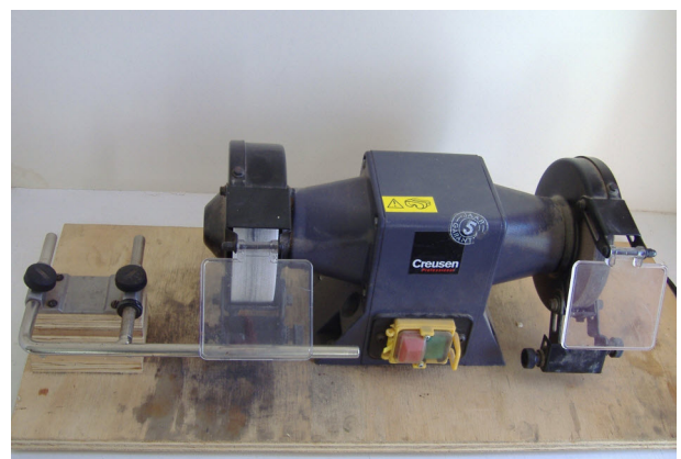
High speed grinder with homemade base showing universal tool support.

If you only use a high speed grinder you can now invest in the Tormek jigs. If you use a Tormek wet grinder as well you can reshape your tool profiles quickly on the high speed grinder and then sharpen them on the Tormek with the same profile. Reshaping on the wetstone alone not only takes a long time but wears the expensive stone down quickly.