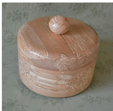
Lidded pot in spalted beech by Bob Hollands.