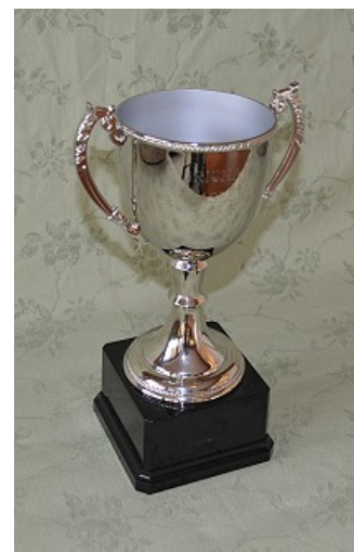
The Richard Haselden Cup