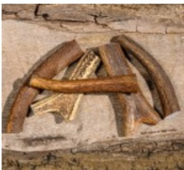
Staglers 100% Natural Deer Antler Dog Chew - Small

Thyme Cub Lathe £100 plus chucks and a large number of gouges etc. (some still in their box) Contact Morris Ekins 01424 845195(after Xmas and lathe to go before tools can be sold).